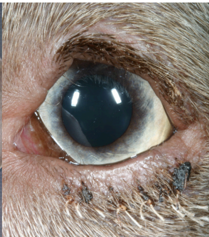
2 weeks after surgery